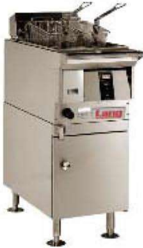
Model 130F-BASE-M shown with optional legs