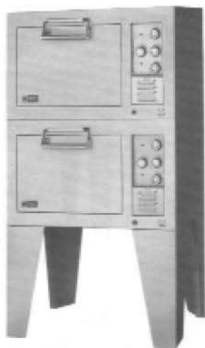
Model D0362M shown