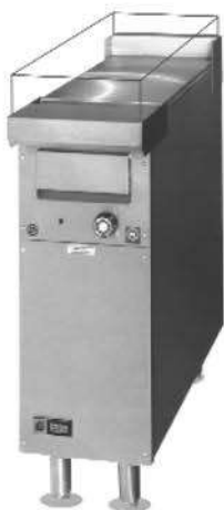
Model R12-ATAM shown